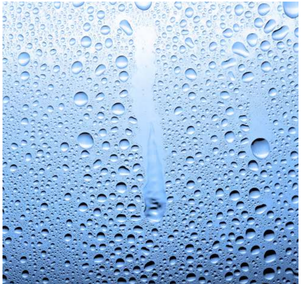
Indoor-generated moisture and moisture-related indoor air quality problems in houses and units in multi-unit residences will be discussed in this helpful guide.

For renters, report all plumbing leaks and moisture problems immediately to your building owner, manager or superintendent. For the owners of condominiums, if the moisture problem is coming from inside your unit, it is likely something you will have to deal with. If the moisture is coming from outside the unit (leaks through walls, windows, doors, ceilings or plumbing), contact your condominium manager.