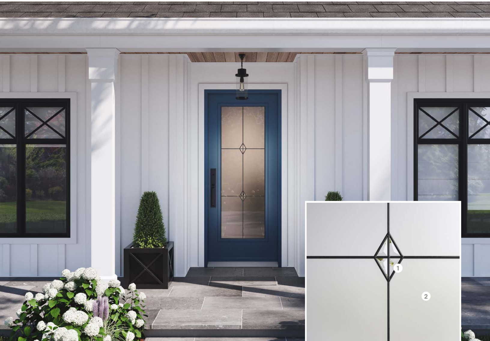
↑ Uno steel door | Luxe 22"×64" patina doorglass ■ Benjamin Moore, Cobalt Blue 2061-20