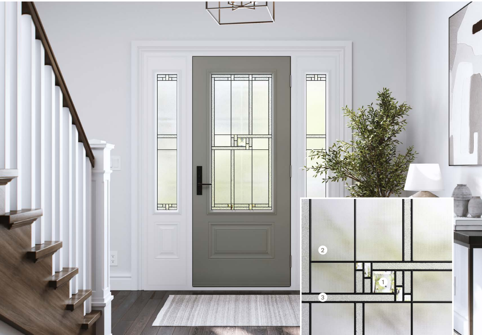
↑ Uno steel door | Rubik 22"× 48" doorglass and 8"× 48" sidelites ■ Gentek, Storm 570