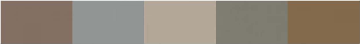
#569 - Saddle Brown